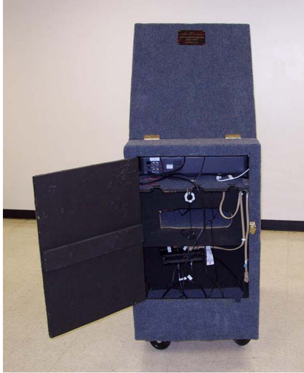
Sound box rear storage for microphone stands and extra cables.