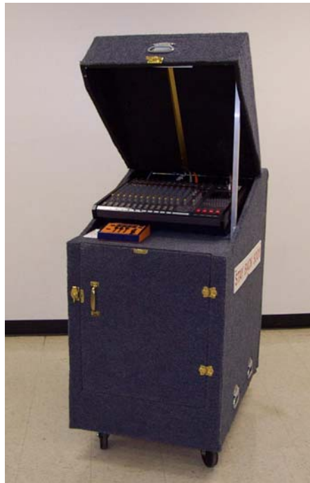
Complete sound system contains a 12-channel sound mixing board, Single disc CD player, Dual cassette player plus space for expansion and storage.