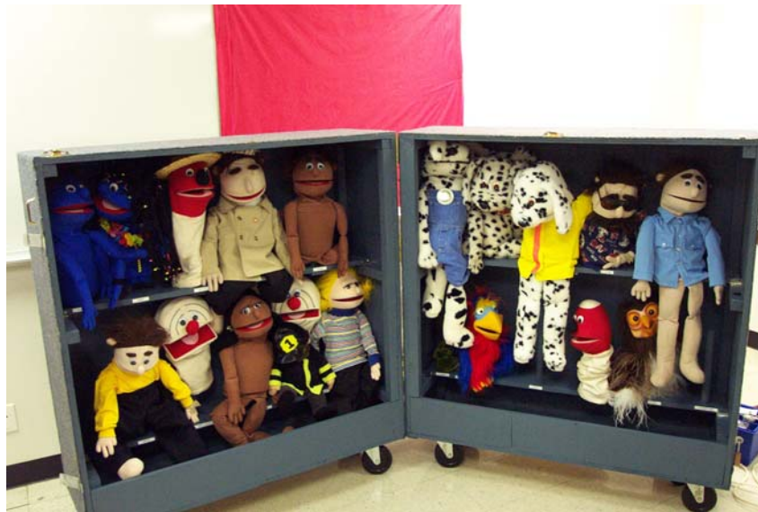
Puppet box holds 20 full size puppets on single dowel rods lower storage areas for speaker stands and props. Fold out shelves for easy removal of puppets.