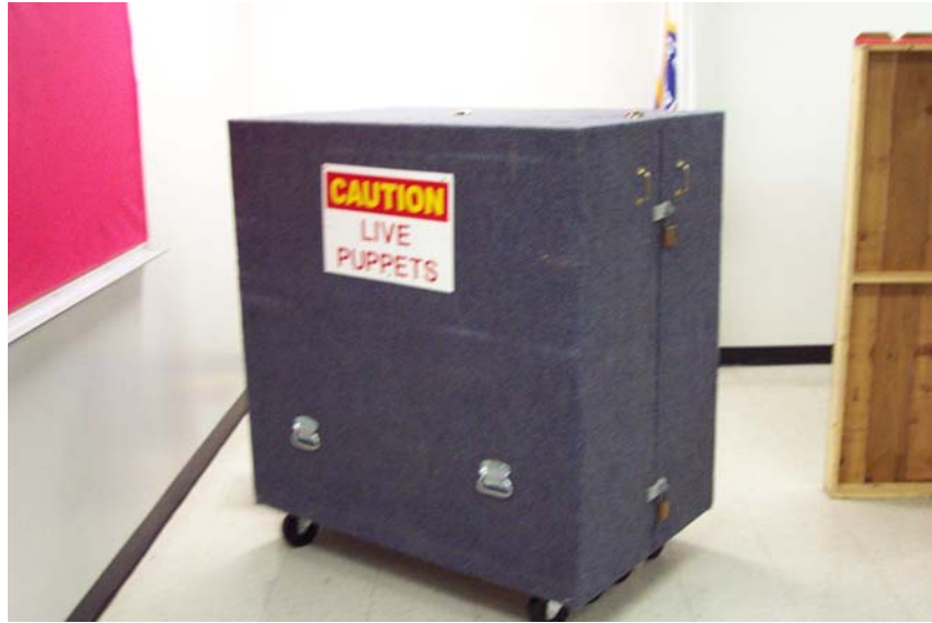
Puppets box in transporting mode.